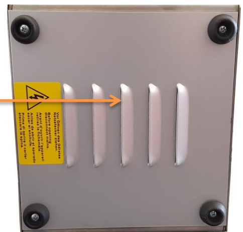
BOTTOM PLATE PRE -ANODIZED ALUMINIUM WITH COOLING HOLES.