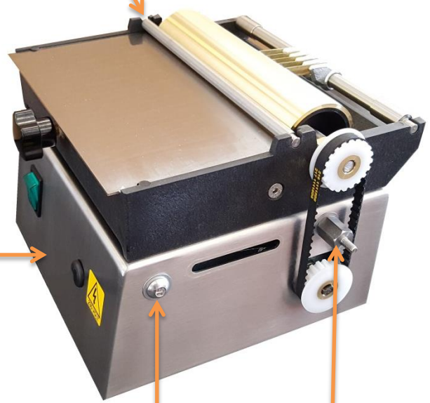
MOTOR HOLDER SCREW IN STAINLESS STEEL